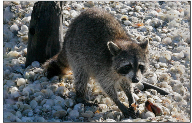
Northern Raccoon, Procyon lotor